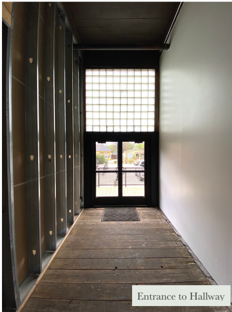
Entrance to Hallway