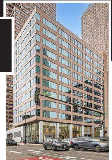
Tower II 1776 Lincoln Street Denver, CO 80202