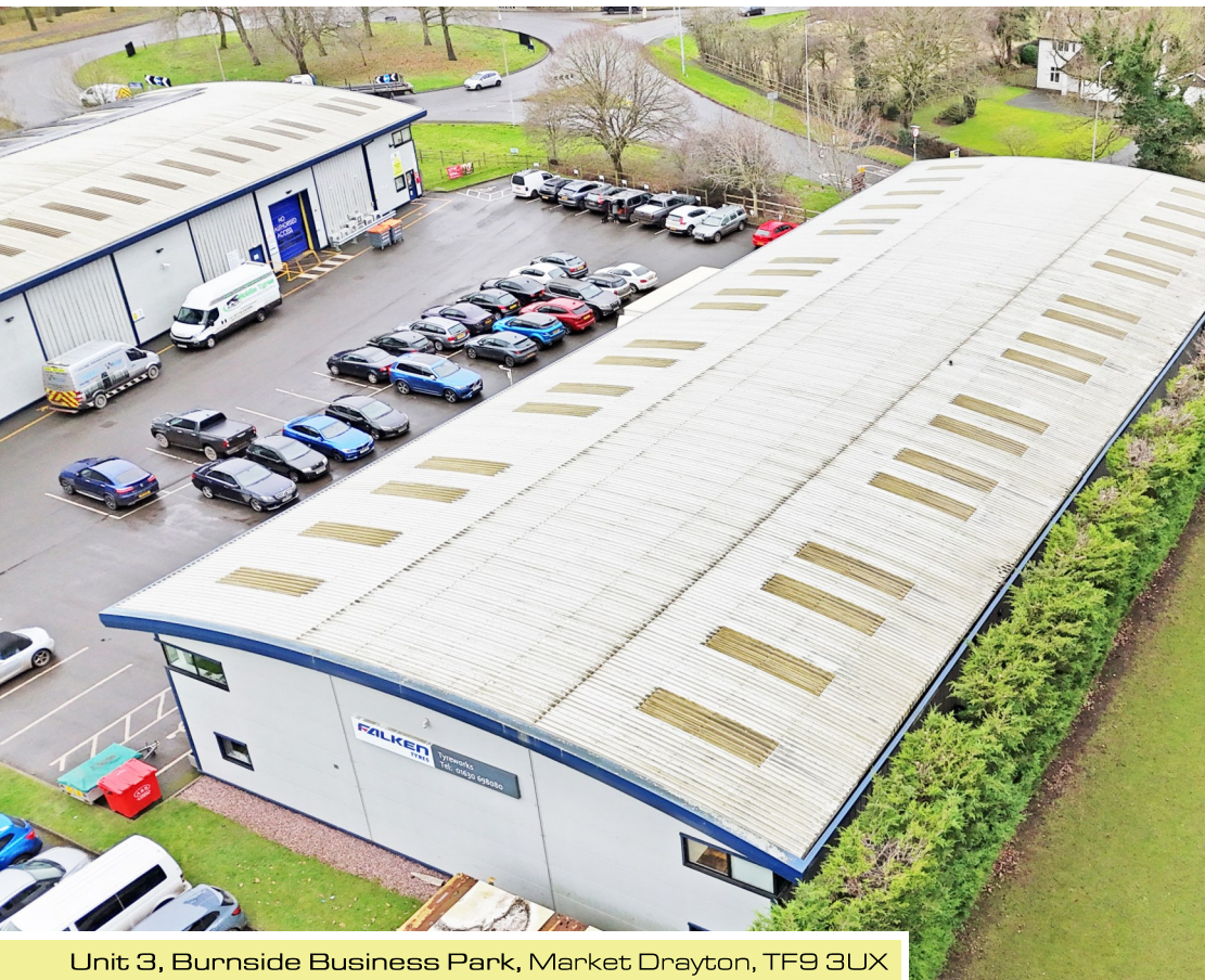
Unit 3, Burnside Business Park, Market Drayton, TF9 3UX

The premises are available by way of a new Full Repairing and Insuring lease on terms to be agreed.