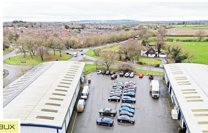
Unit 3, Burnside Business Park, Market Drayton, TF9 3UX