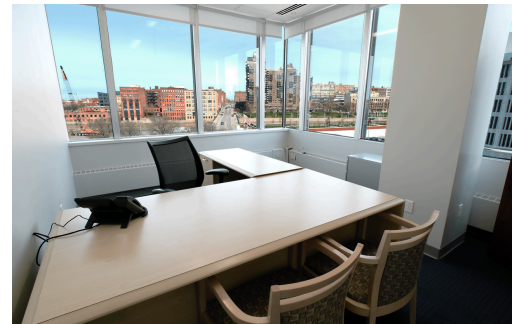
4 PERIMETER OFFICES