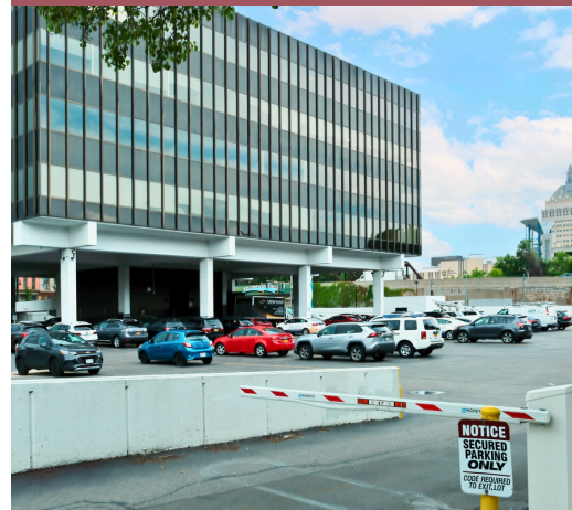
SECURE ON-SITE PARKING LOT