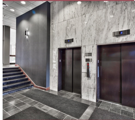
MARBLE LINED ELEVATOR