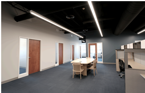
MOSTLY OPEN FLOORPLAN