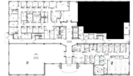
First Floor - Key Plan

Southern Crescent Center II 83 Upper Riverdale Road Riverdale, GA 30274