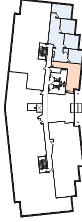
OVERALL 2ND FLOOR PLAN