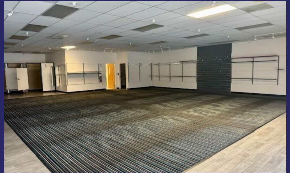
Sales Counter/Changing Rooms