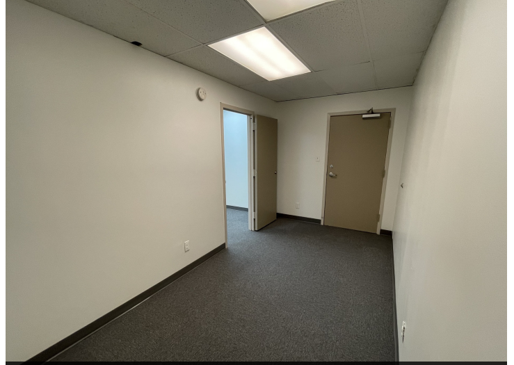
Suite 100- Private Office