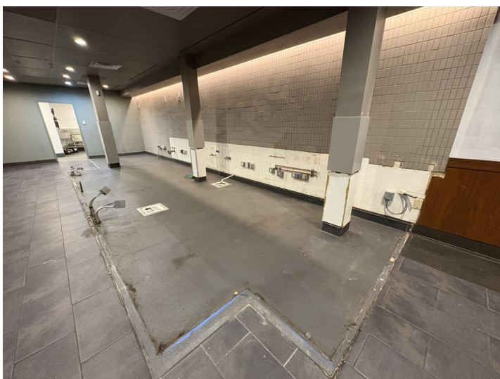
Former Counter Area