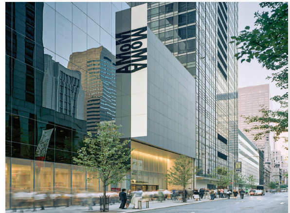
MUSEUM OF MODERN ART