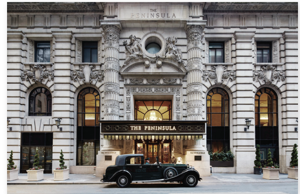
THE PENINSULA HOTEL