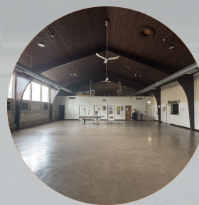
Large Gym/Meeting Hall