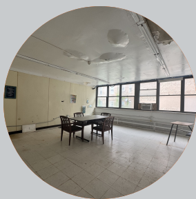
8 - 10 Classrooms