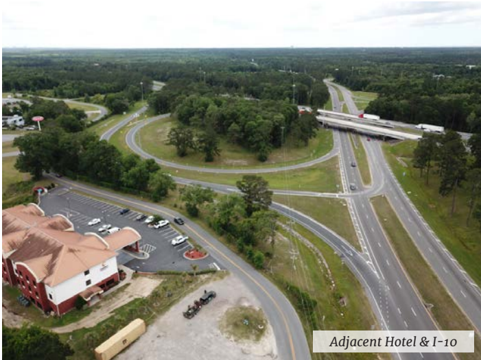
Adjacent Hotel & I-10