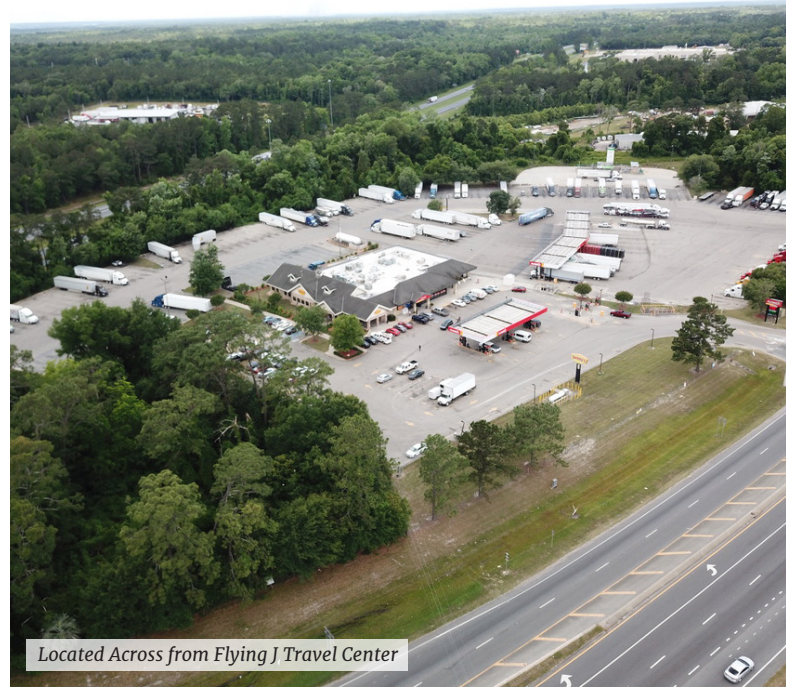
Located Across from Flying J Travel Center