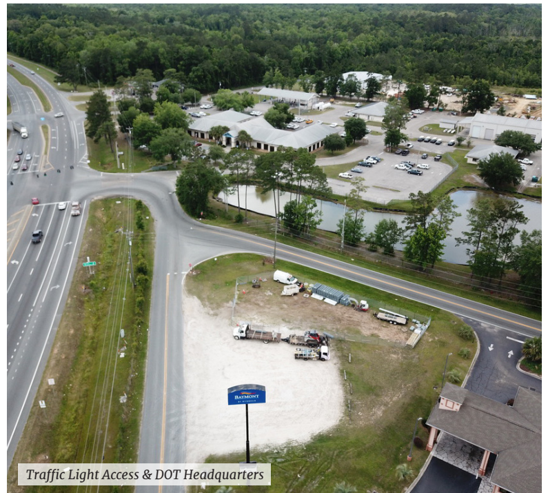
Traffic Light Access & DOT Headquarters