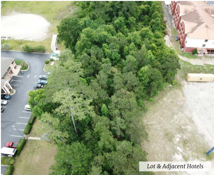
Lot & Adjacent Hotels