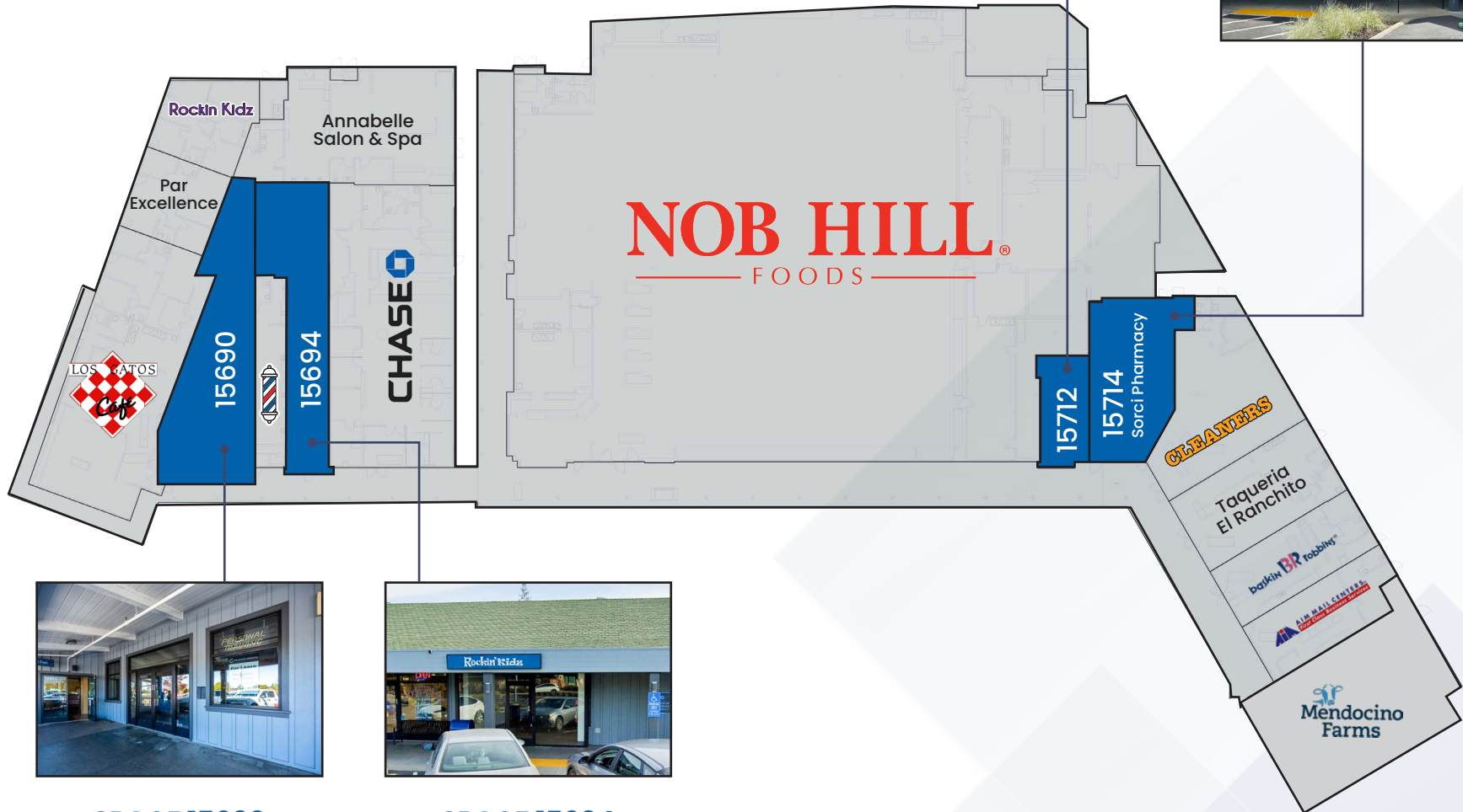
SPACE 15690 ±1,587 – 3,951 SF