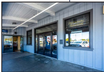
SPACE 15690 ±1,587 – 3,951 SF