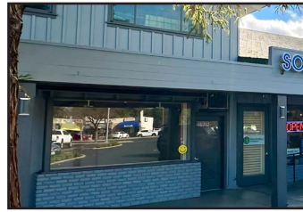
SPACE 15712 ±550 SF