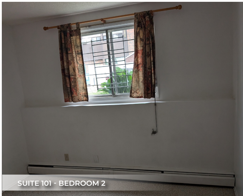
SUITE 101 - BEDROOM 2