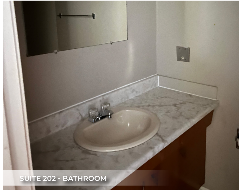
SUITE 202 - BATHROOM