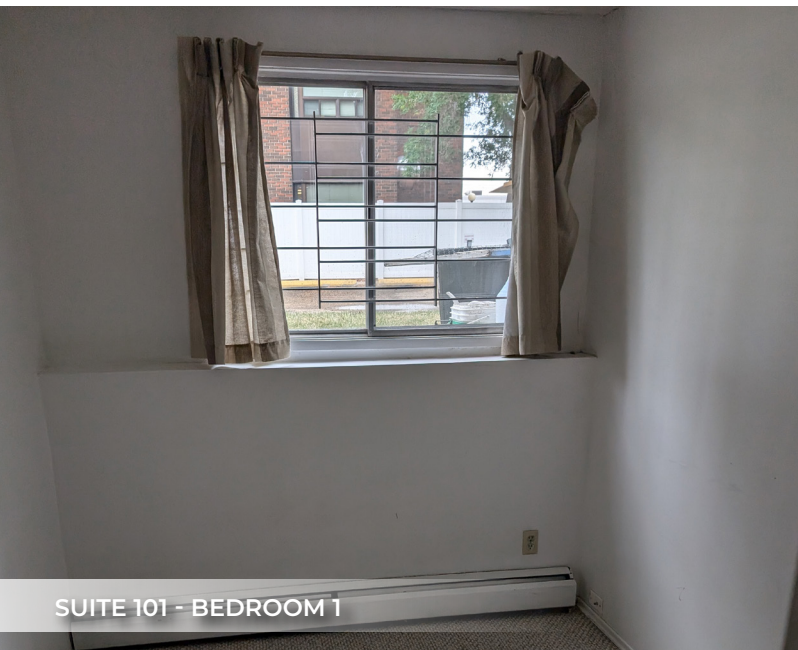
SUITE 101 - BEDROOM 1