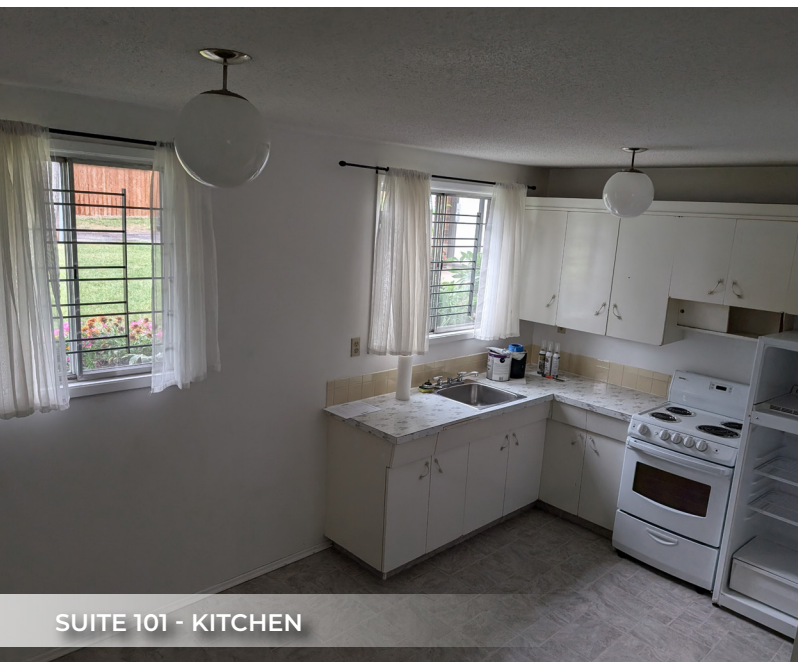
SUITE 101 - KITCHEN