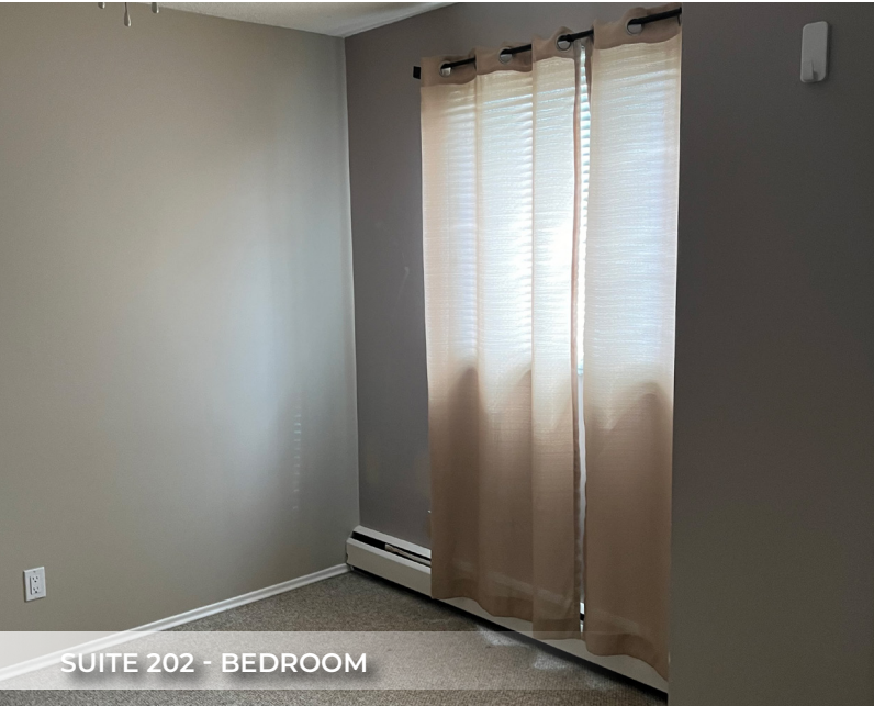
SUITE 202 - BEDROOM