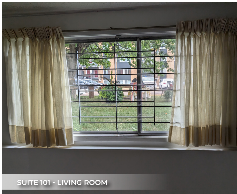
SUITE 101 - LIVING ROOM