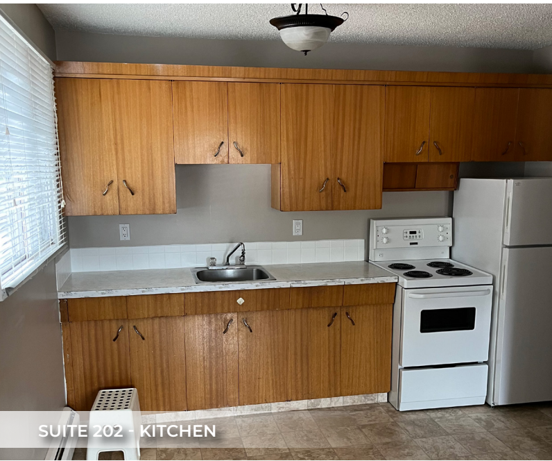
SUITE 202 - KITCHEN