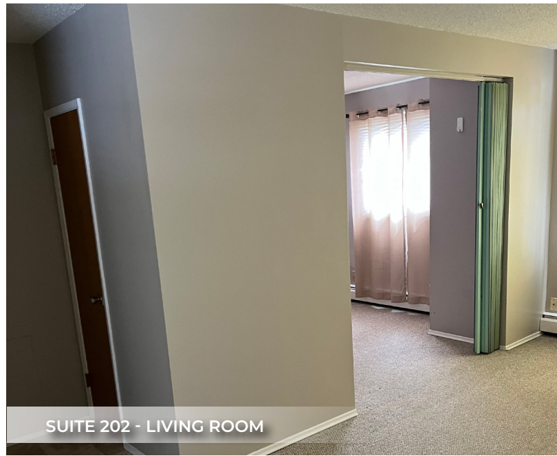
SUITE 202 - LIVING ROOM