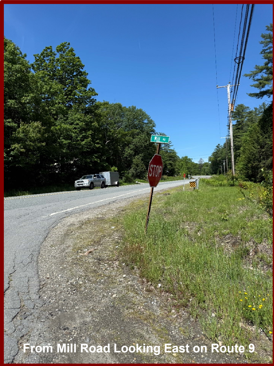
From Mill Road Looking East on Route 9