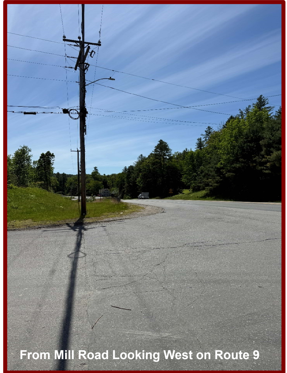
From Mill Road Looking West on Route 9