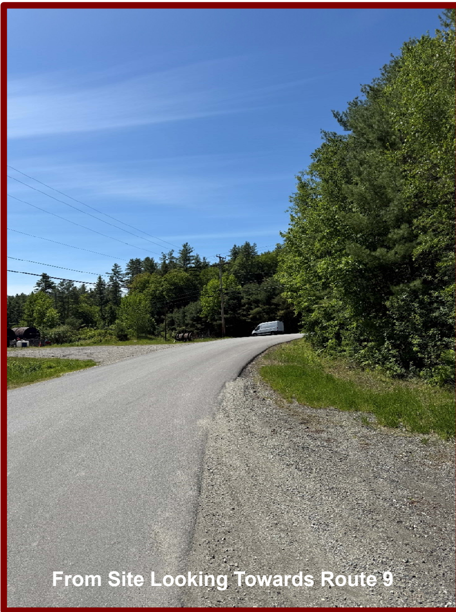
From Site Looking Towards Route 9