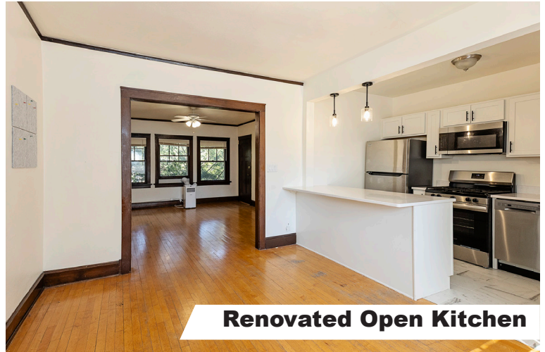
Renovated Open Kitchen