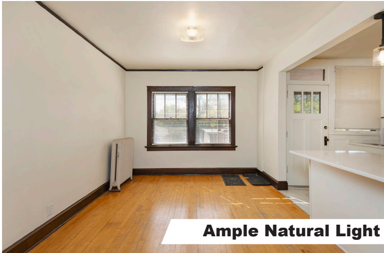
Ample Natural Light