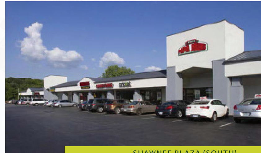
SHAWNEE PLAZA (SOUTH)