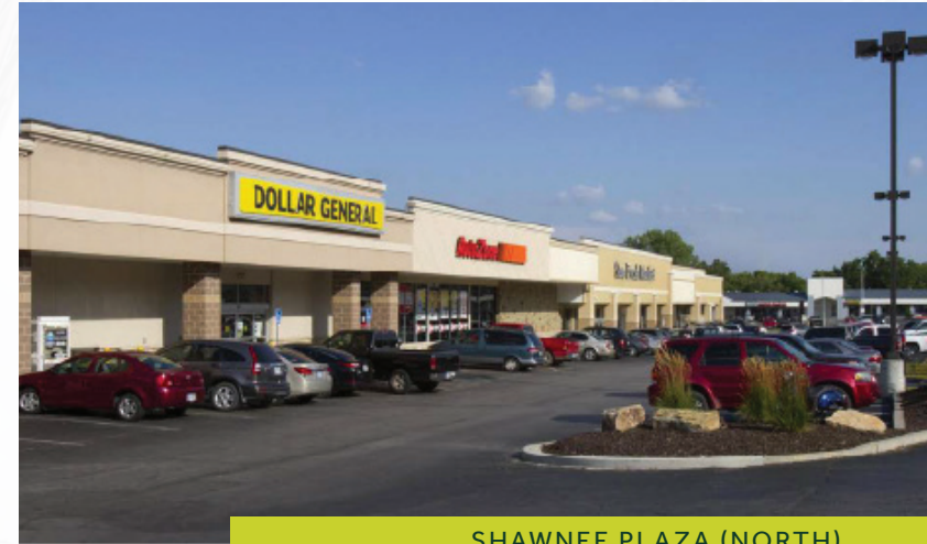
SHAWNEE PLAZA (NORTH)