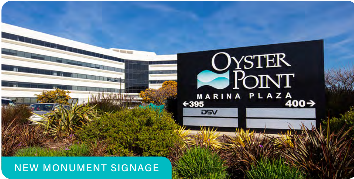
NEW MONUMENT SIGNAGE