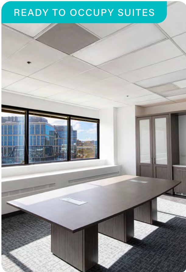
READY TO OCCUPY SUITES