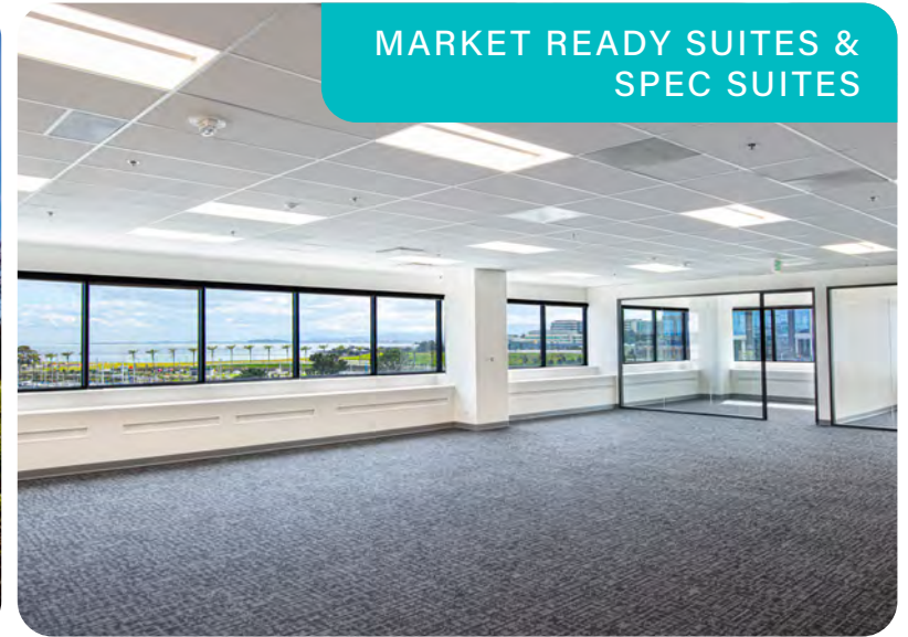
MARKET READY SUITES & SPEC SUITES