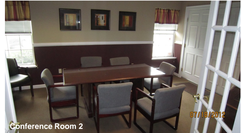
Conference Room 2