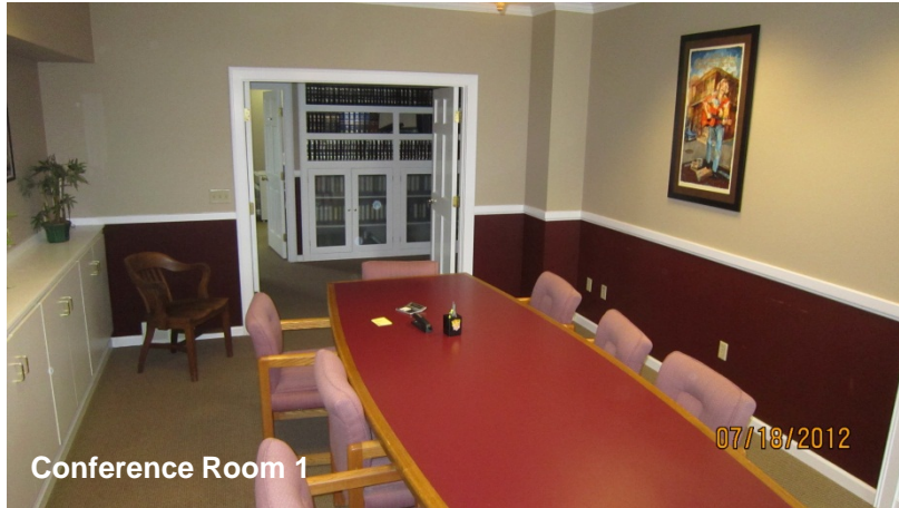
Conference Room 1