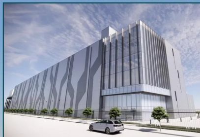
FUTURE SITE OF GOODMAN LAX01 DATA CENTER ±5.6 ACRES