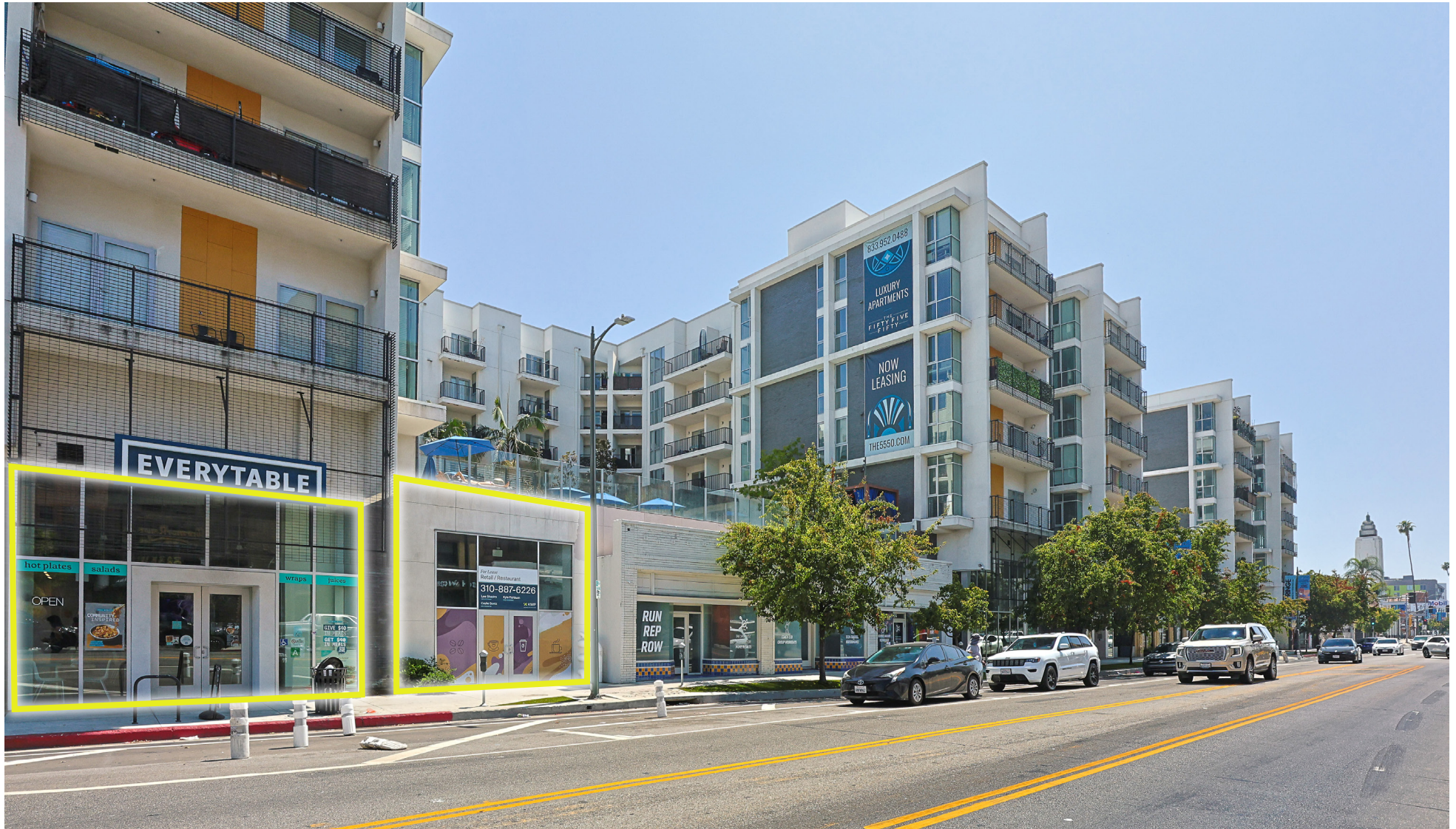
Next to Orangetheory fitness

±925 SF retail space & ±935 SF retail space can be combined to ±1,859 SF