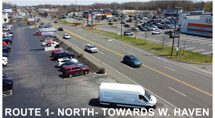
ROUTE 1- NORTH- TOWARDS W. HAVEN