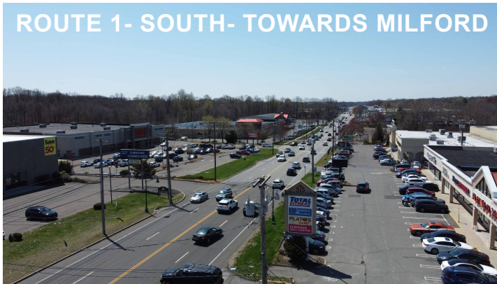
ROUTE 1- SOUTH- TOWARDS MILFORD