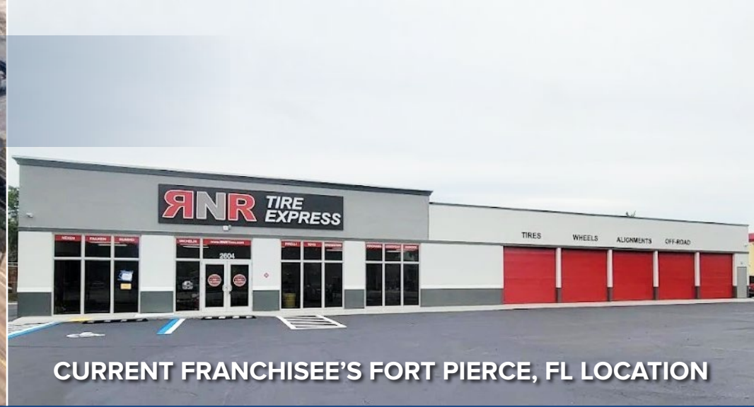
CURRENT FRANCHISEE'S FORT PIERCE, FL LOCATION