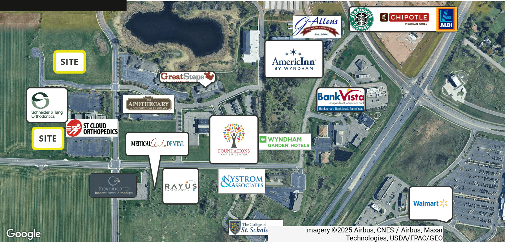
Imagery ©2025 Airbus, CNES / Airbus, Maxar Technologies, USDA/FPAC/GEO