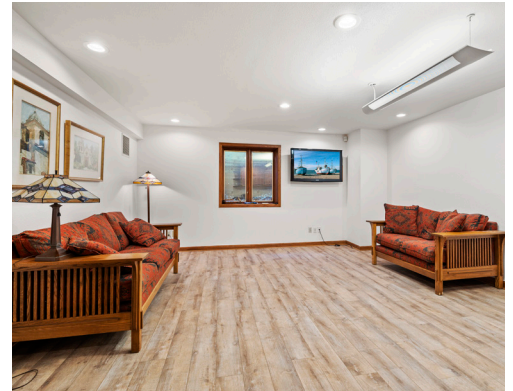
Basement lounge with abundant natural light