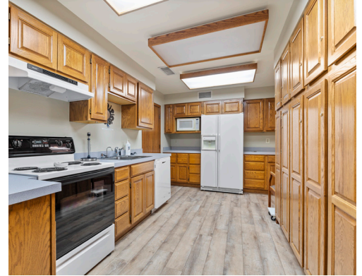
Full Basement Kitchen