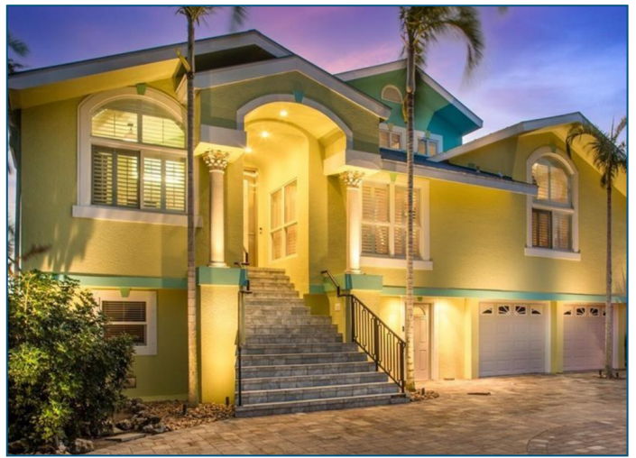
PROPERTY FRONT VIEW