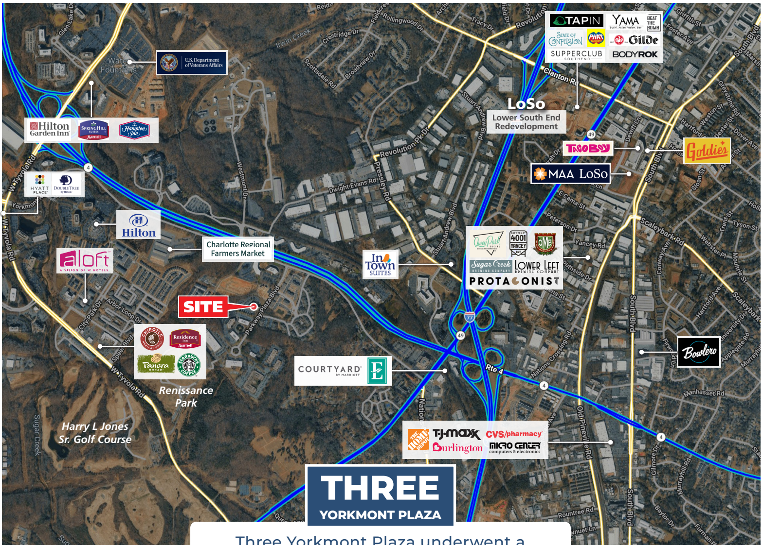
Three Yorkmont Plaza underwent a complete common area renovation in 2023