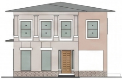
LOT 4 ELEVATION