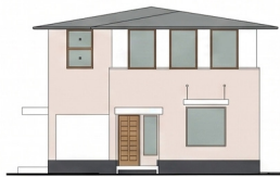
LOT 5 ELEVATION