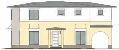
LOT 2 ELEVATION