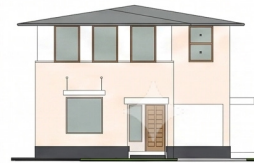
LOT 3 ELEVATION