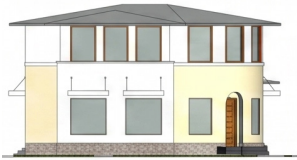
LOT 1 ELEVATION