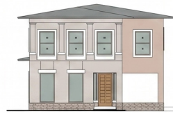
LOT 6 ELEVATION