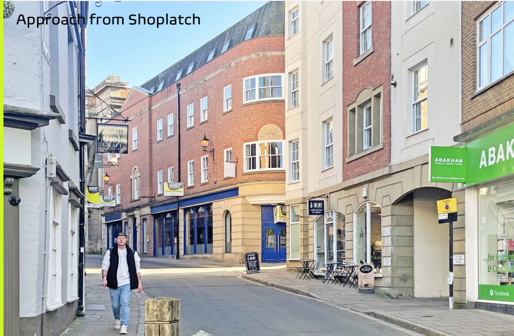
Approach from Shoplatch