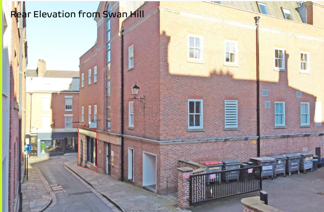
Rear Elevation from Swan Hill