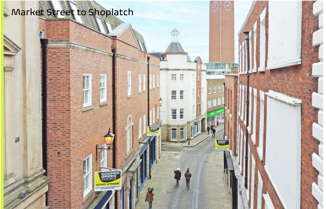
Market Street to Shoplatch