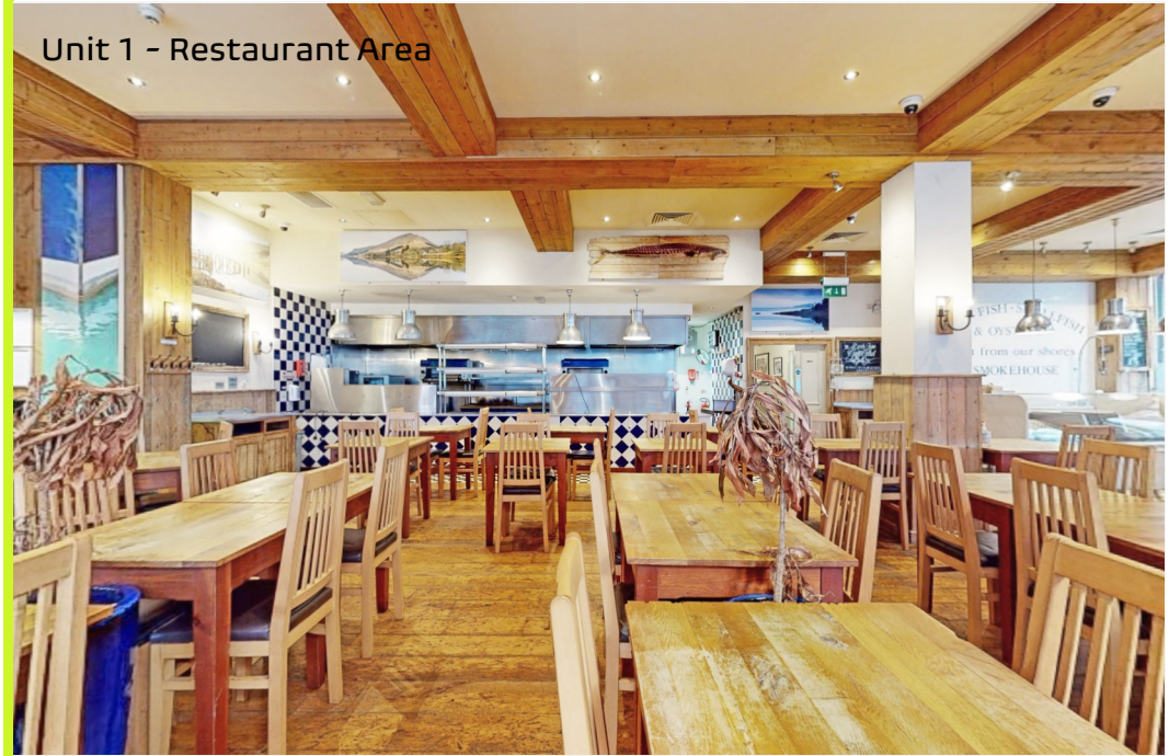
Unit 1, Talbot House, 11-15 Market Street, Shrewsbury, Shropshire, SY1 1LG