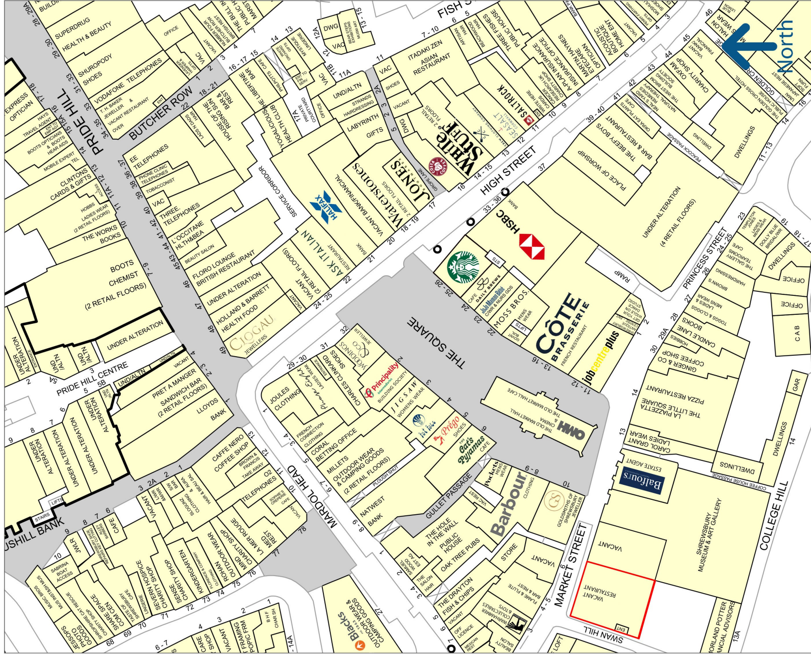
Unit 1, Talbot House, 11-15 Market Street, Shrewsbury, Shropshire , SY1 1LG