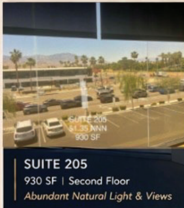
SUITE 205 930 SF | Second Floor Abundant Natural Light & Views