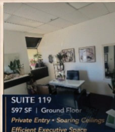
SUITE 119 597 SF | Ground Floor Private Entry • Soaring Ceilings Efficient Executive Space