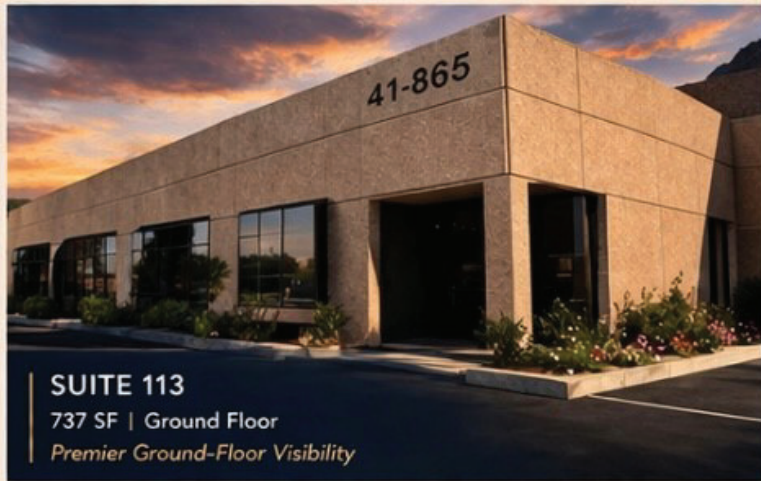
SUITE 113 737 SF | Ground Floor Premier Ground-Floor Visibility