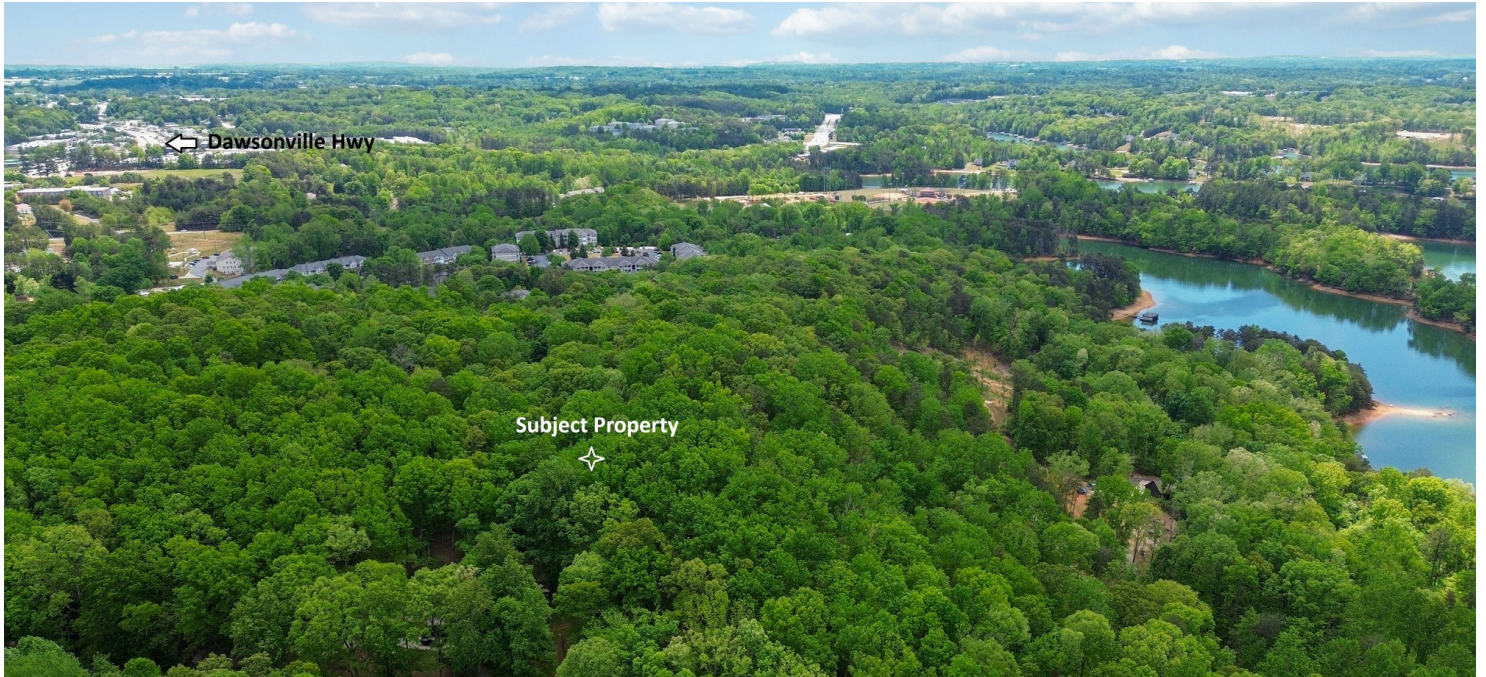
Hall County GIS