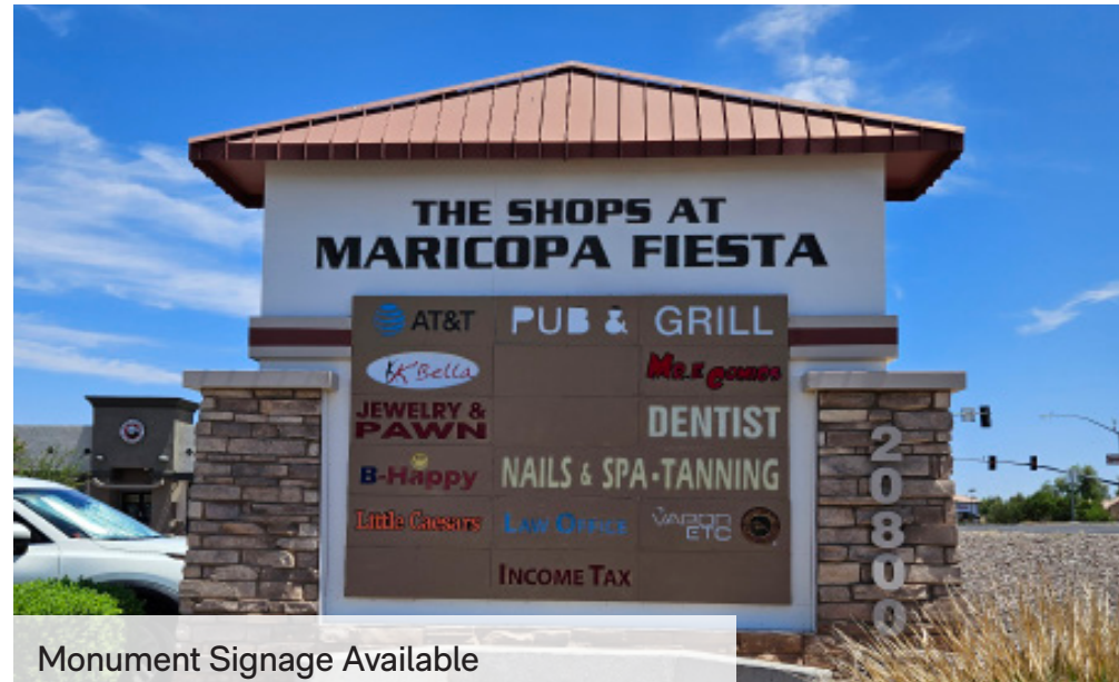
Monument Signage Available