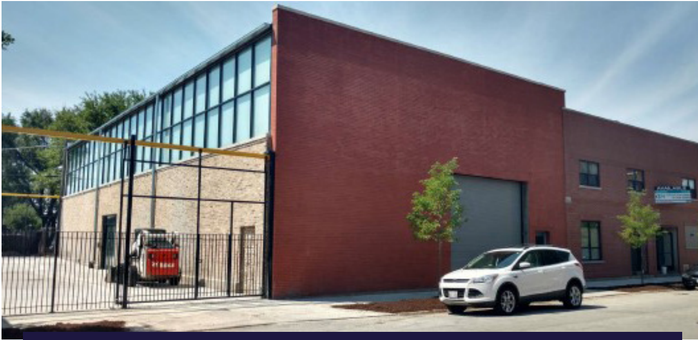
1725 WEST HUBBARD STREET, CHICAGO, IL