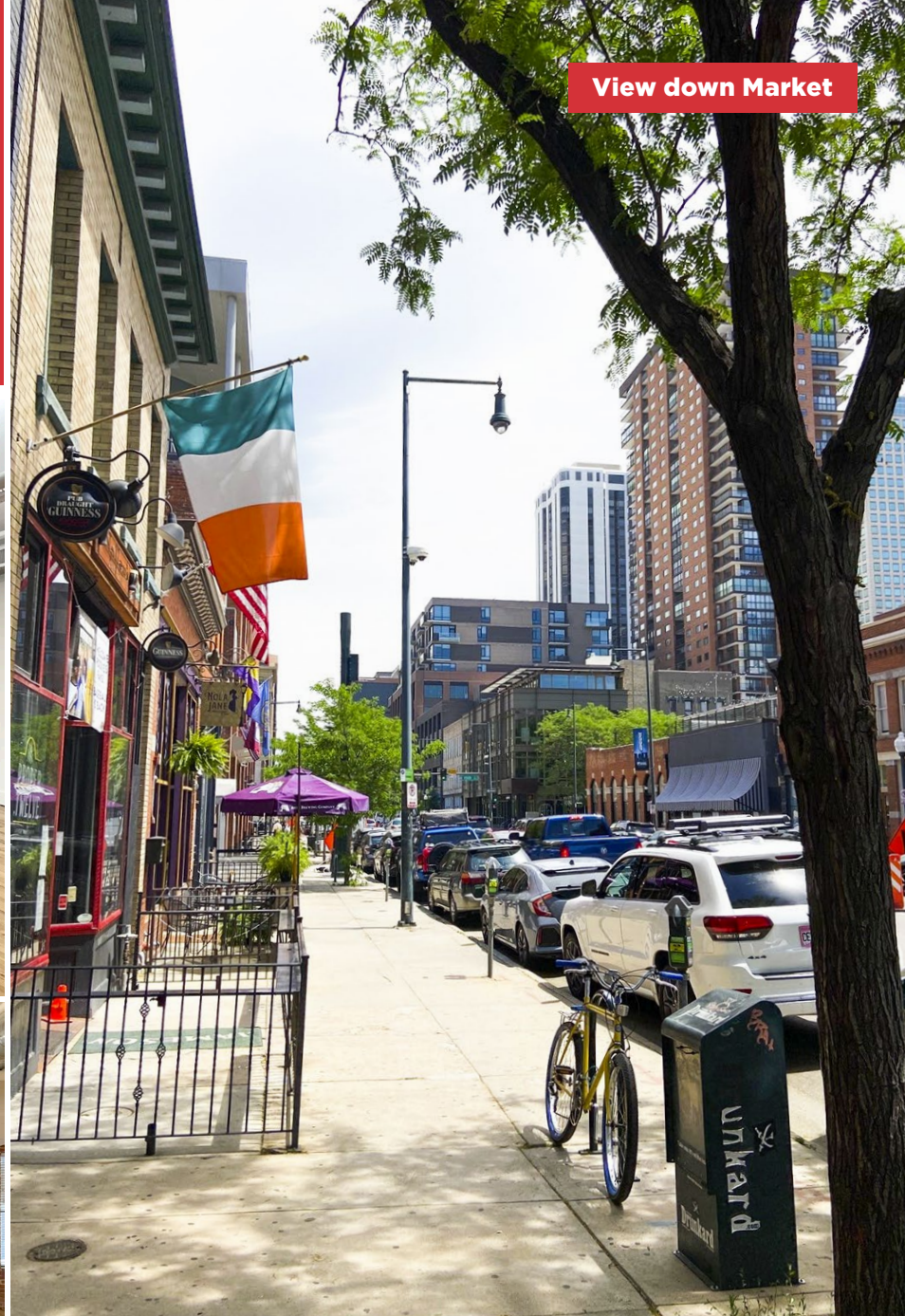
View down Market