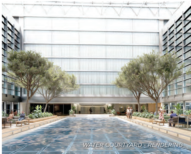
WATER COURTYARD - RENDERING

Brickell Arch, a Luxury Collection Hotel 201 guest rooms