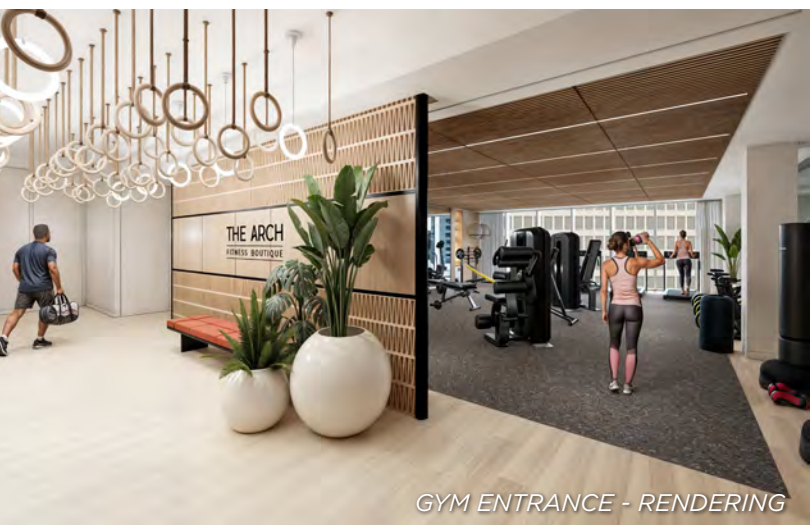
GYM ENTRANCE - RENDERING