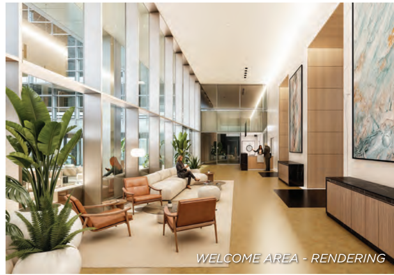
WELCOME AREA - RENDERING