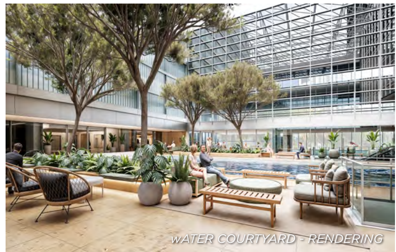
WATER COURTYARD - RENDERING