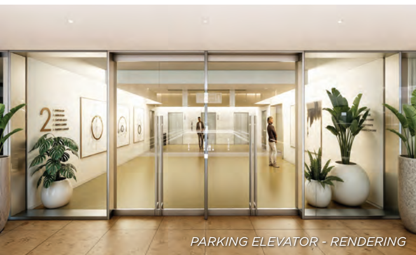
PARKING ELEVATOR - RENDERING