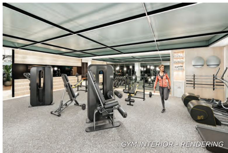
GYM INTERIOR - RENDERING