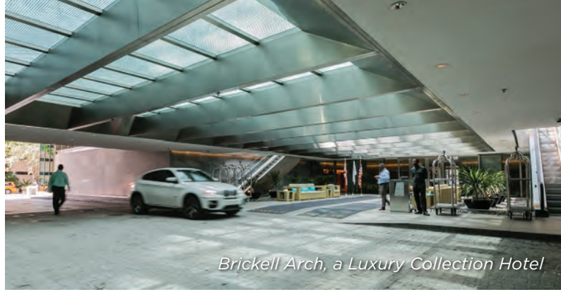
Brickell Arch, a Luxury Collection Hotel