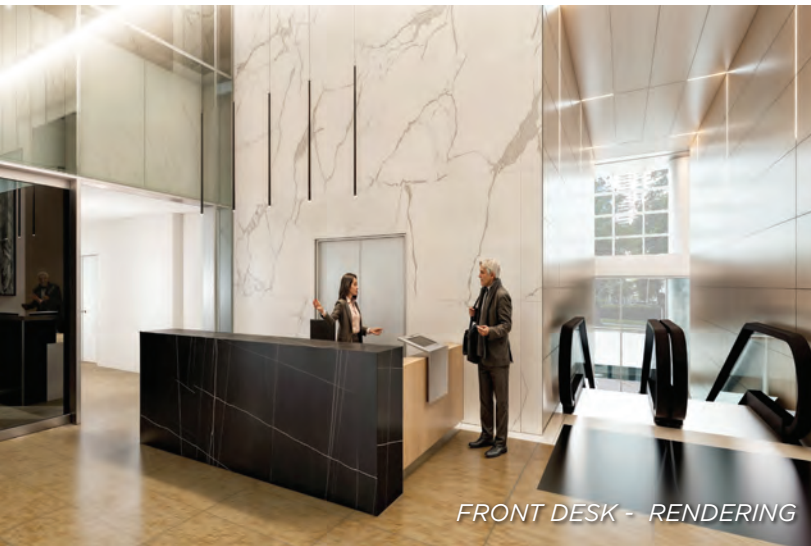
FRONT DESK - RENDERING