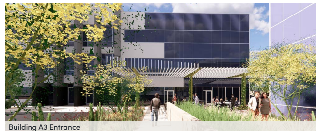
Building A3 Entrance