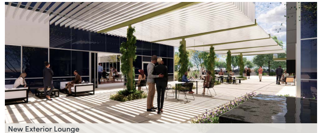
New Exterior Lounge