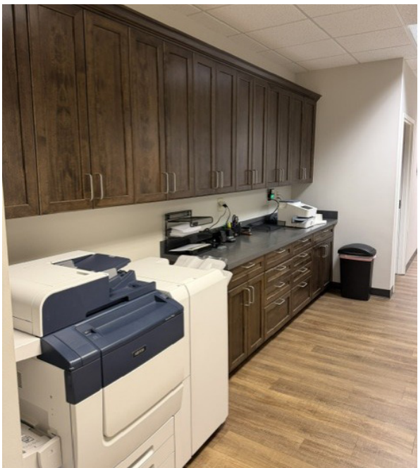
OFFICE SPACE FOR LEASE | CREEDMOOR CENTRE | RALEIGH, NC 27615