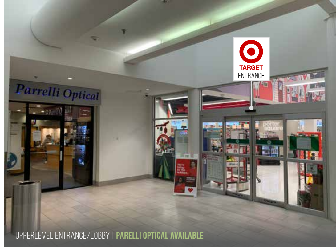
UPPERLEVEL ENTRANCE/LOBBY | PARELLI OPTICAL AVAILABLE

Porter Square Galleria is a rare opportunity with parking in the heart of Cambridge. Steps from the Porter Square Red Line MBTA Station, this location provides unapparelled access by foot, public transportation and by car. Join the area's only Target store in this densely populated trade area, which sits just five minutes from both Harvard and Davis Squares.