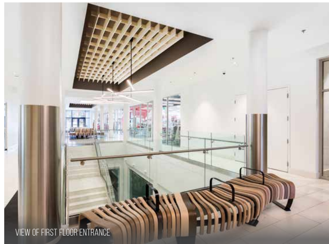
VIEW OF FIRST FLOOR ENTRANCE