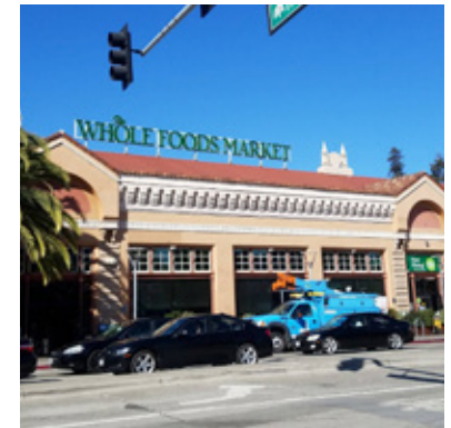
WHOLE FOODS MARKET