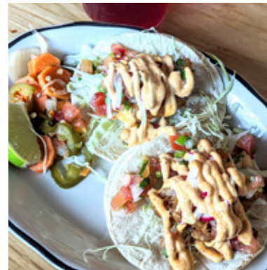
COMAL NEXT DOOR