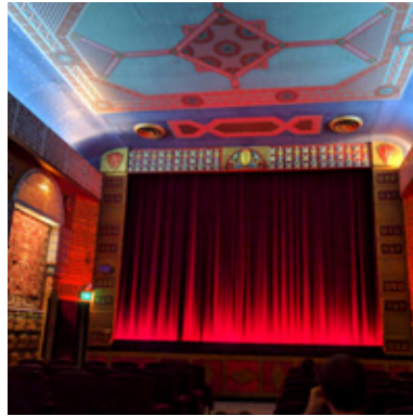
GRAND LAKE THEATRE

Whether you're a first-time buyer, an investor, or looking to upgrade, this property provides a rare opportunity to own in one of Oakland's most sought-after areas.