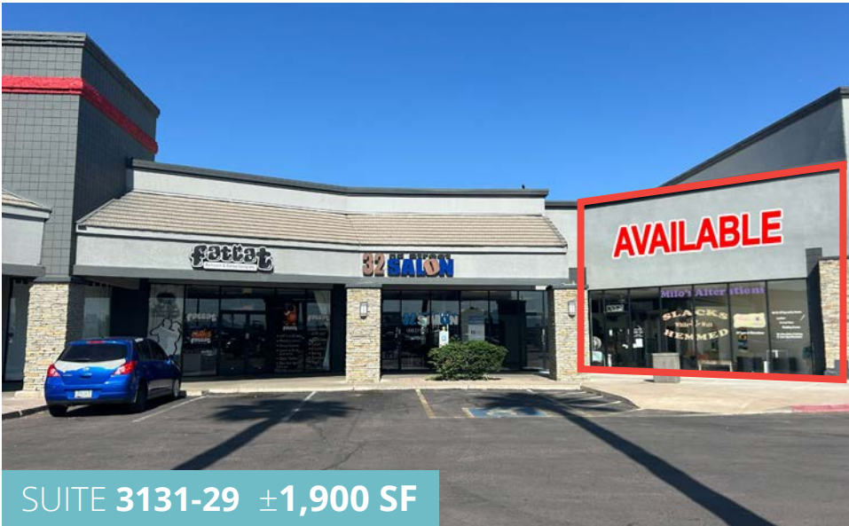
SUITE 3131-29 ±1,900 SF