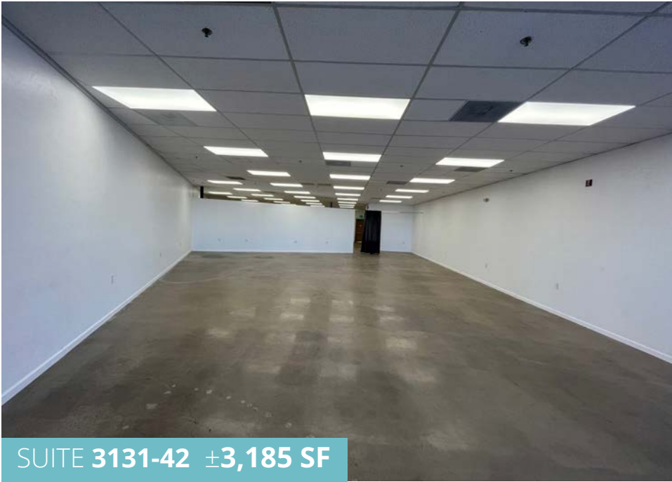
SUITE 3131-42 ±3,185 SF