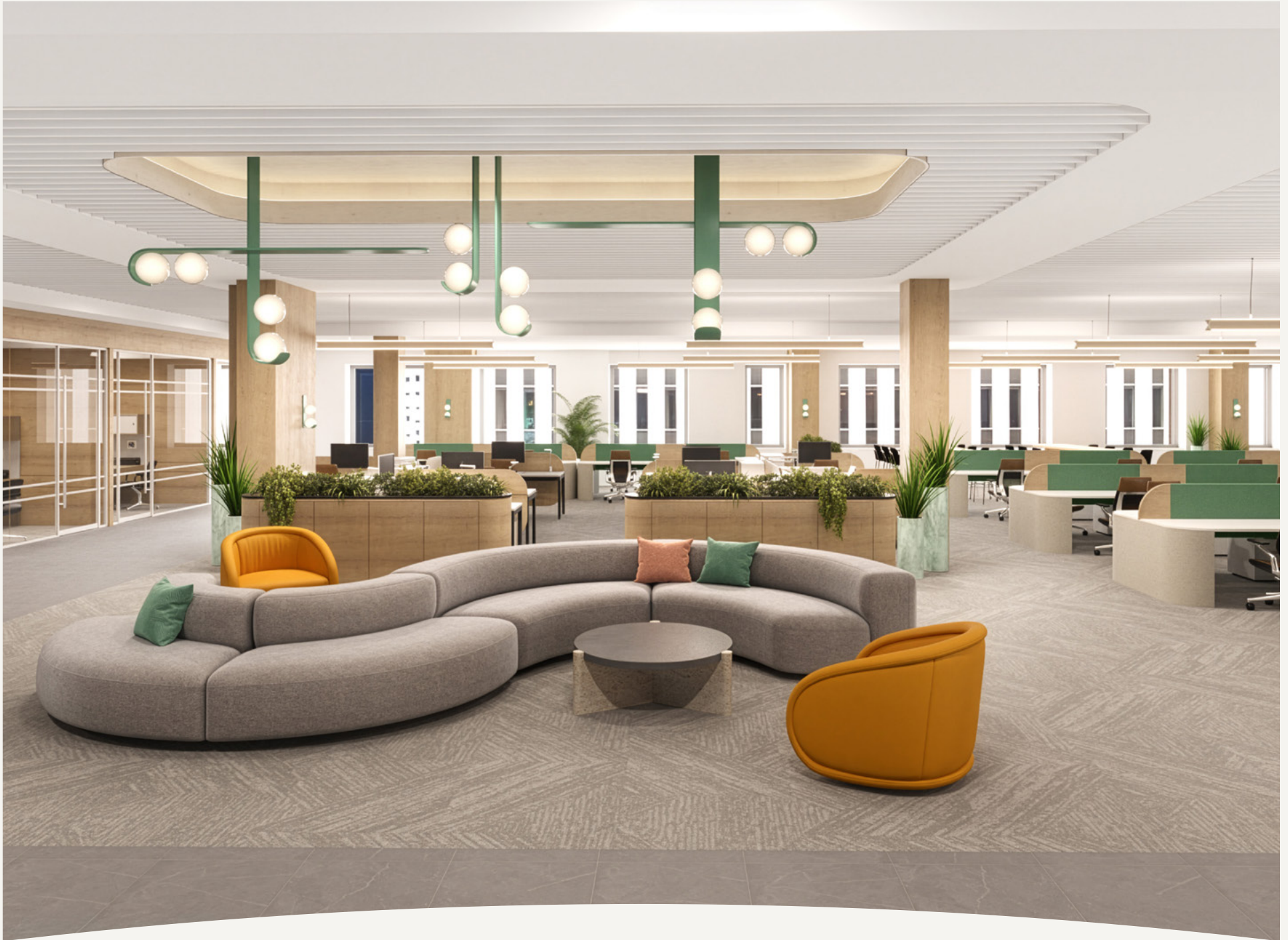
Base Floor Open Work