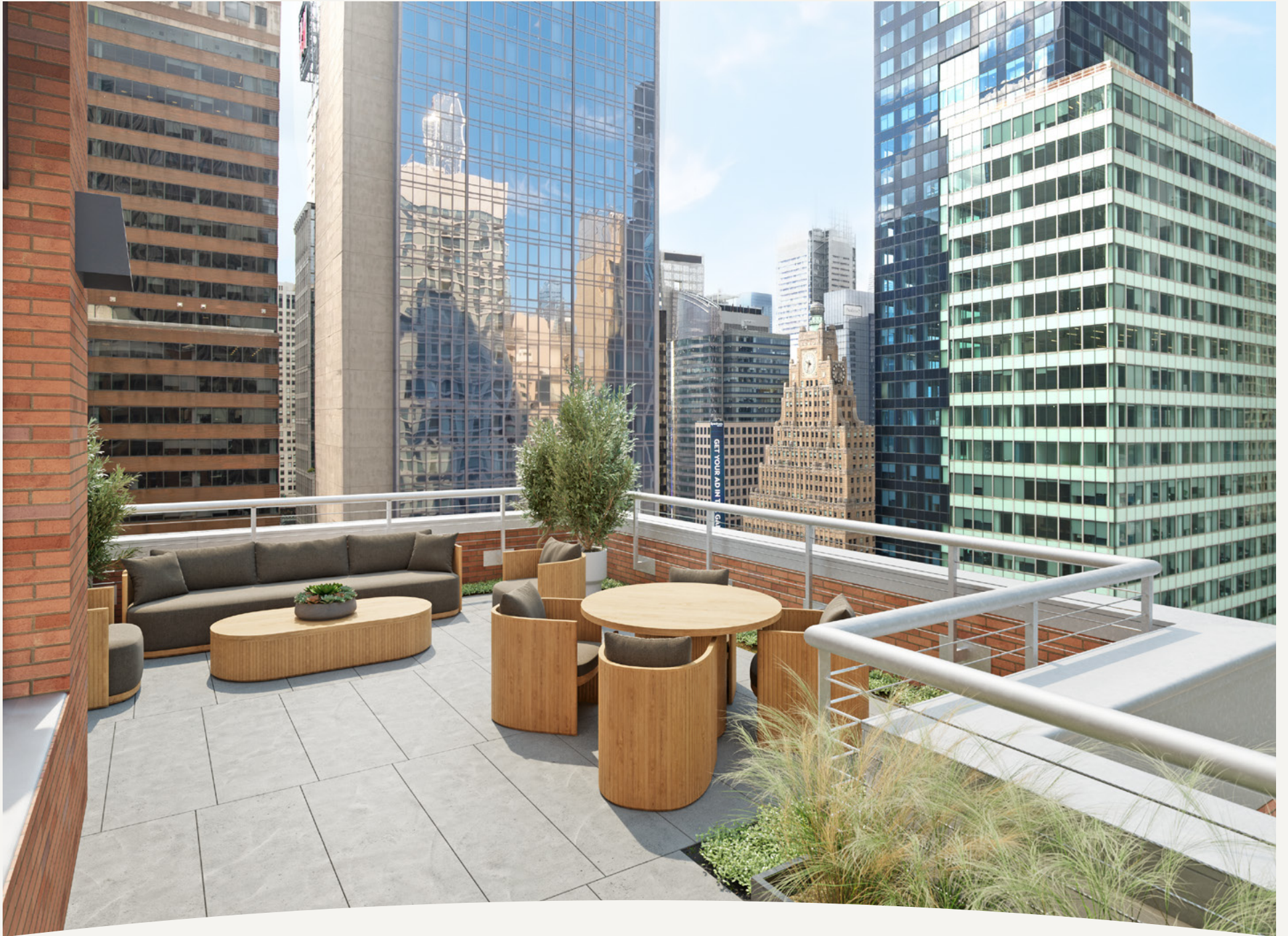
24 th Floor Southwest Terrace