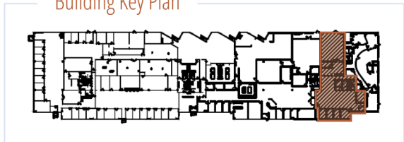
Building Key Plan

OFFICE AREA 4,258 SF WHSE AREA 1,318 SF 5,576 SF Total