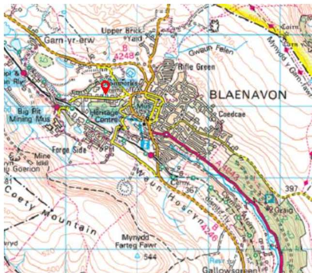
Plans are for identification purposes only. Not drawn to scale.

Torfaen County Borough Council. www.torfaen.gov.uk