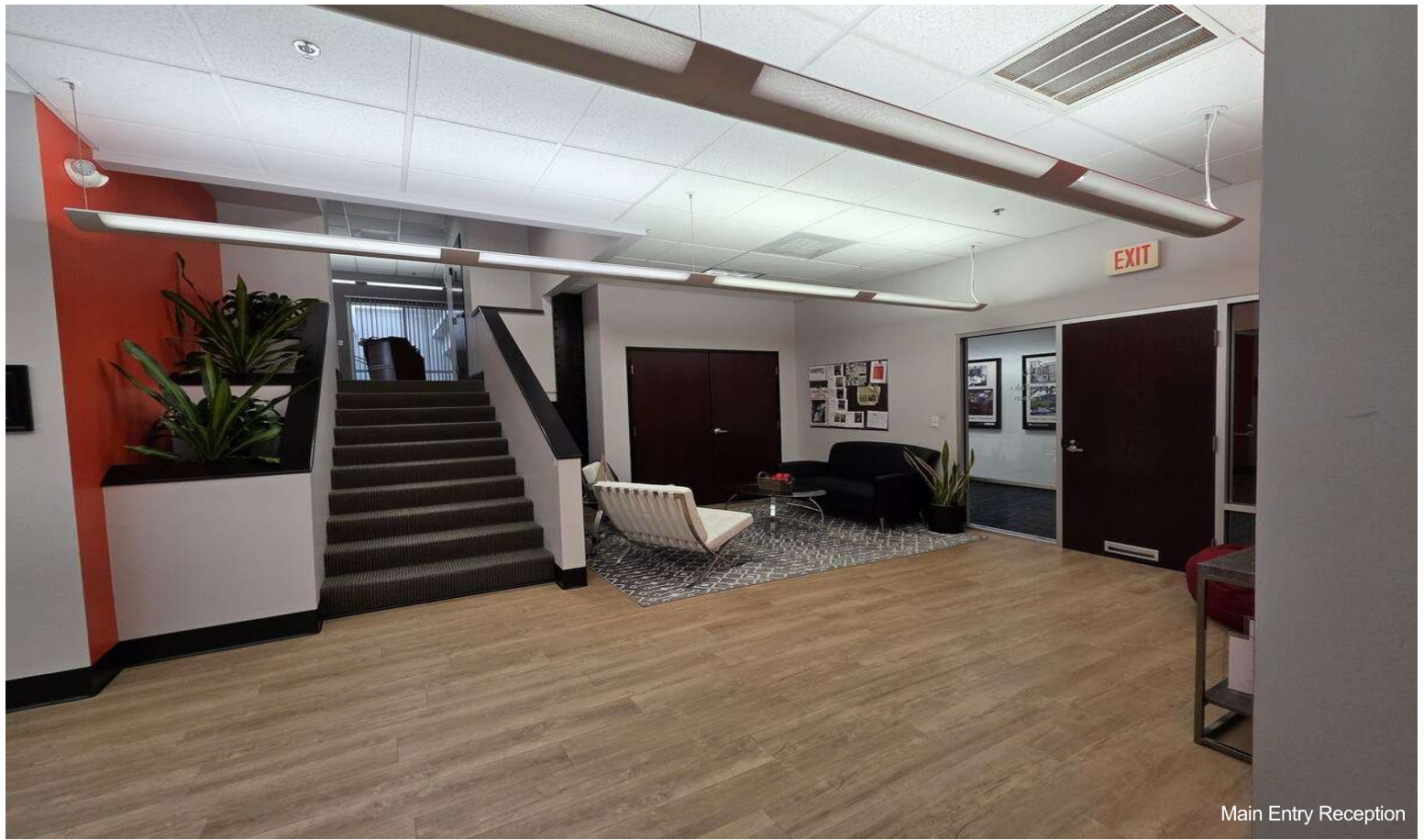
Main Entry Reception