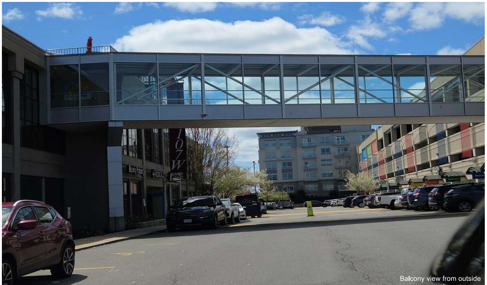
Balcony view from outside