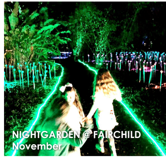
NIGHTGARDEN @ FAIRCHILD November