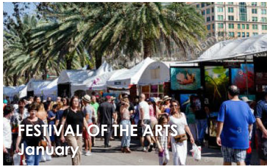
FESTIVAL OF THE ARTS January