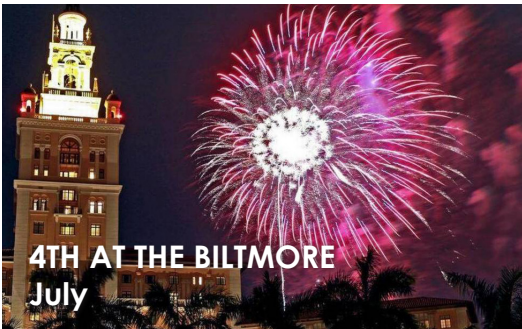
4TH AT THE BILTMORE July