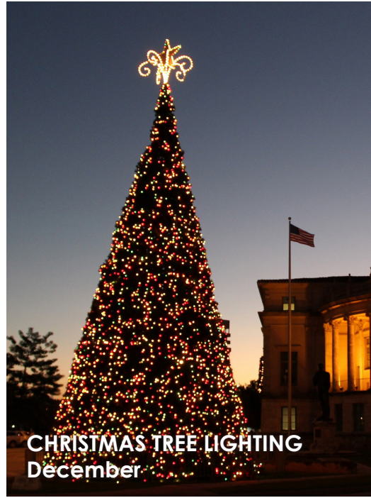
CHRISTMAS TREE LIGHTING December