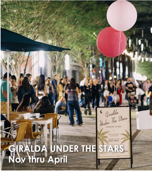
GIRALDA UNDER THE STARS Nov thru April