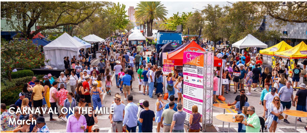
CARNAVAL ON THE MILE March