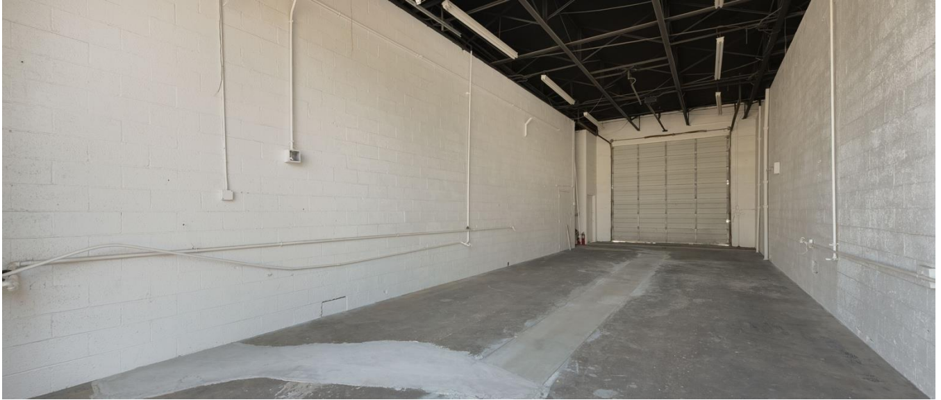
Suite #4 – Clear Height 18' / Depth 58' / Width 15' / Roll Up Door Height 13'