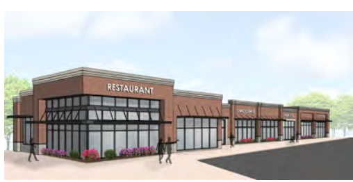
EXTERIOR PERSPECTIVE RENDERING - 08/13/2024