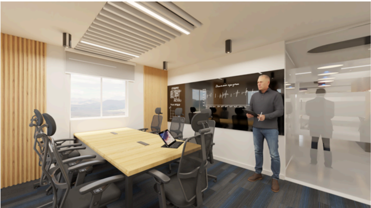
Shared Conference/Meeting Room