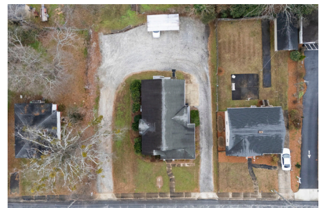
Each Office Is Independently Owned And Operated