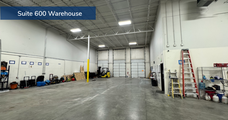
Suite 600 Warehouse